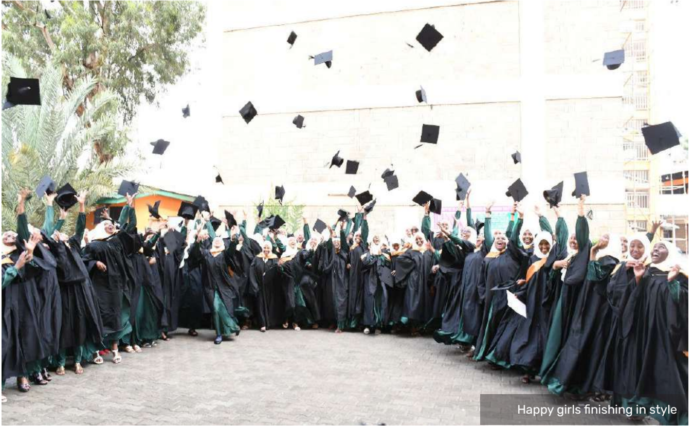
Happy girls finishing in style