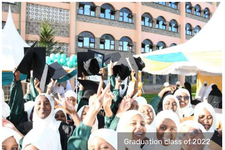
Graduation class of 2022