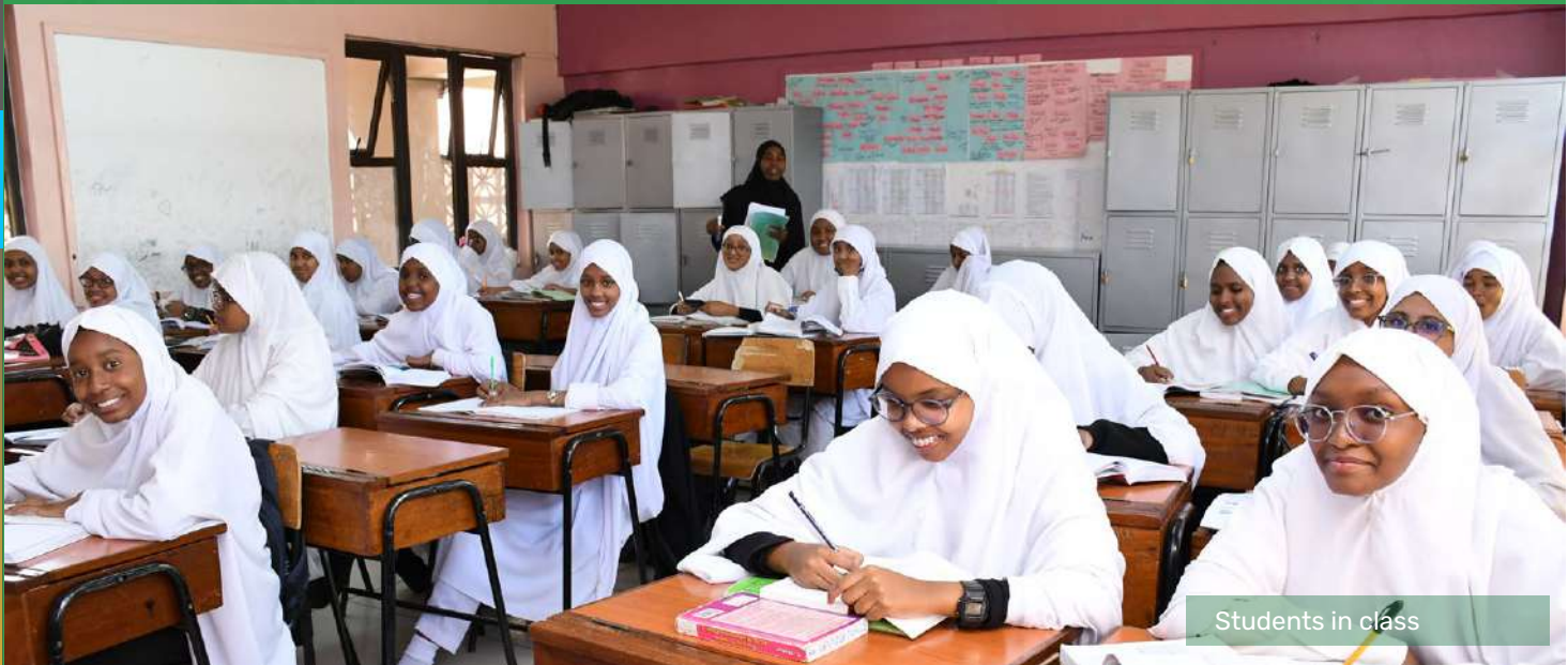
Students in class

WE ARE TRANSITIONING FROM THE 8.4.4. SYSTEM TO THE COMPETENCY BASED CURRICULUM (CBC)