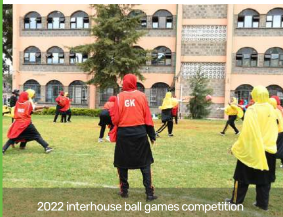
2022 interhouse ball games competition

T here are a variety of clubs and societies like Journalism, Drama, Junior Achievement, Debate, Science, Maths, Wildlife and Red Crescent. Training in sporting activities like Football, Netball, Volleyball, Swimming and Athletics is available. The school also organizes inter house competition at school level and interschool competition with girls schools.