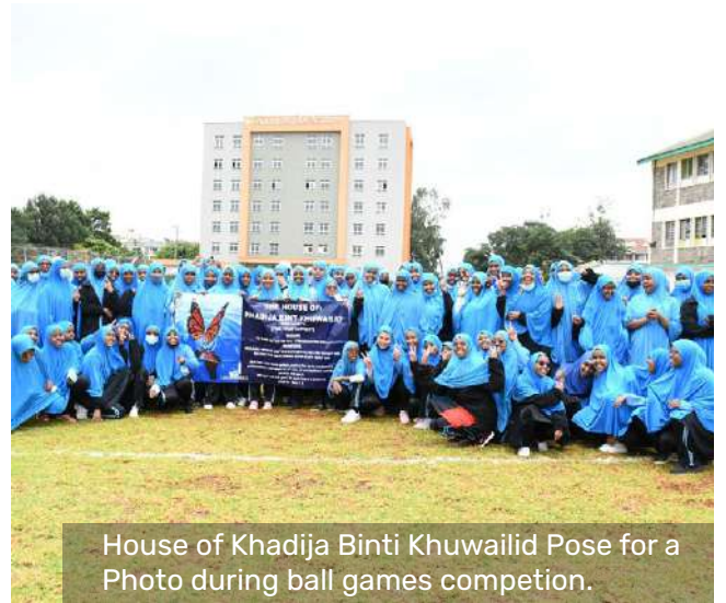
House of Khadija Binti Khuwailid Pose for a Photo during ball games competition.