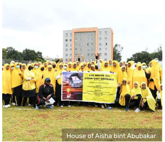
House of Aisha bint Abubakar