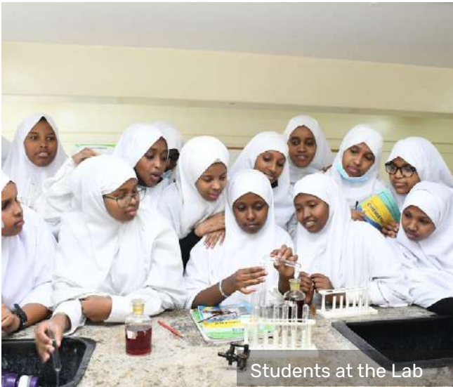
Students at the Lab