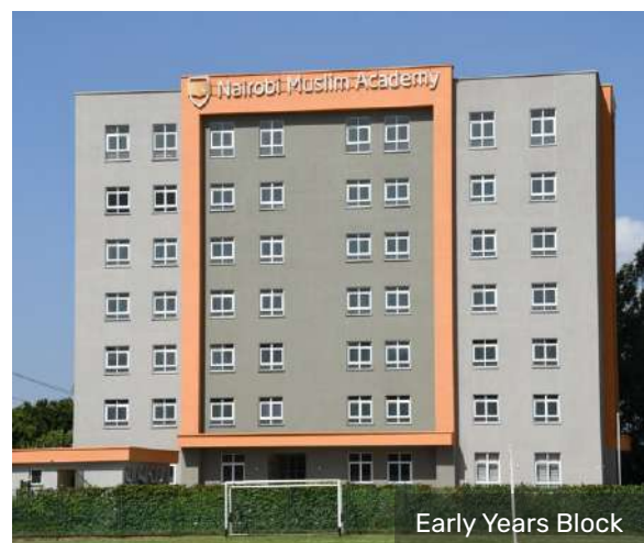
Early Years Block