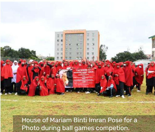
House of Mariam Binti Imran Pose for a Photo during ball games competition.