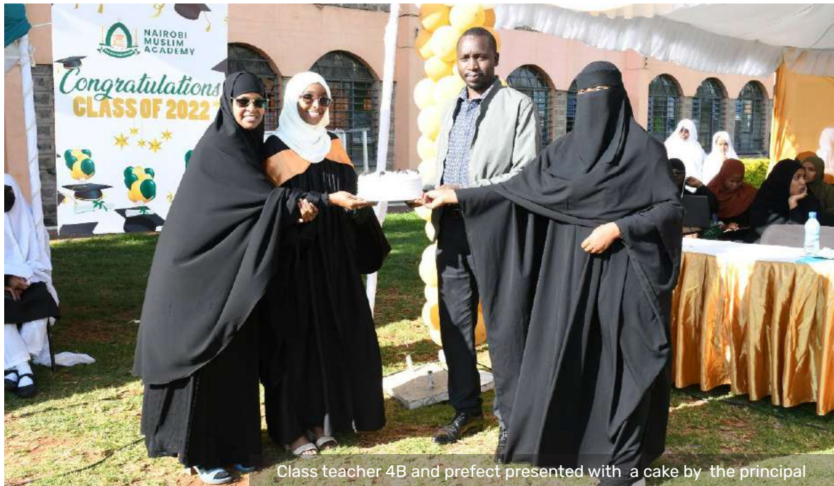
Class teacher 4B and prefect presented with a cake by the principal

There are effective teacher support initiatives in our institution that have ensured their continuous professional growth.