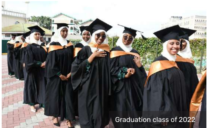
Graduation class of 2022