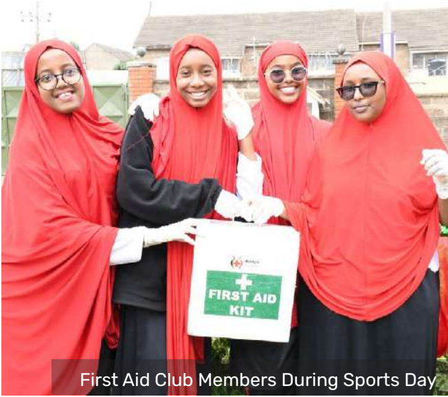
First Aid Club Members During Sports Day