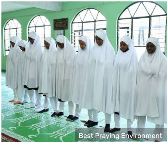
Best Praying Environment